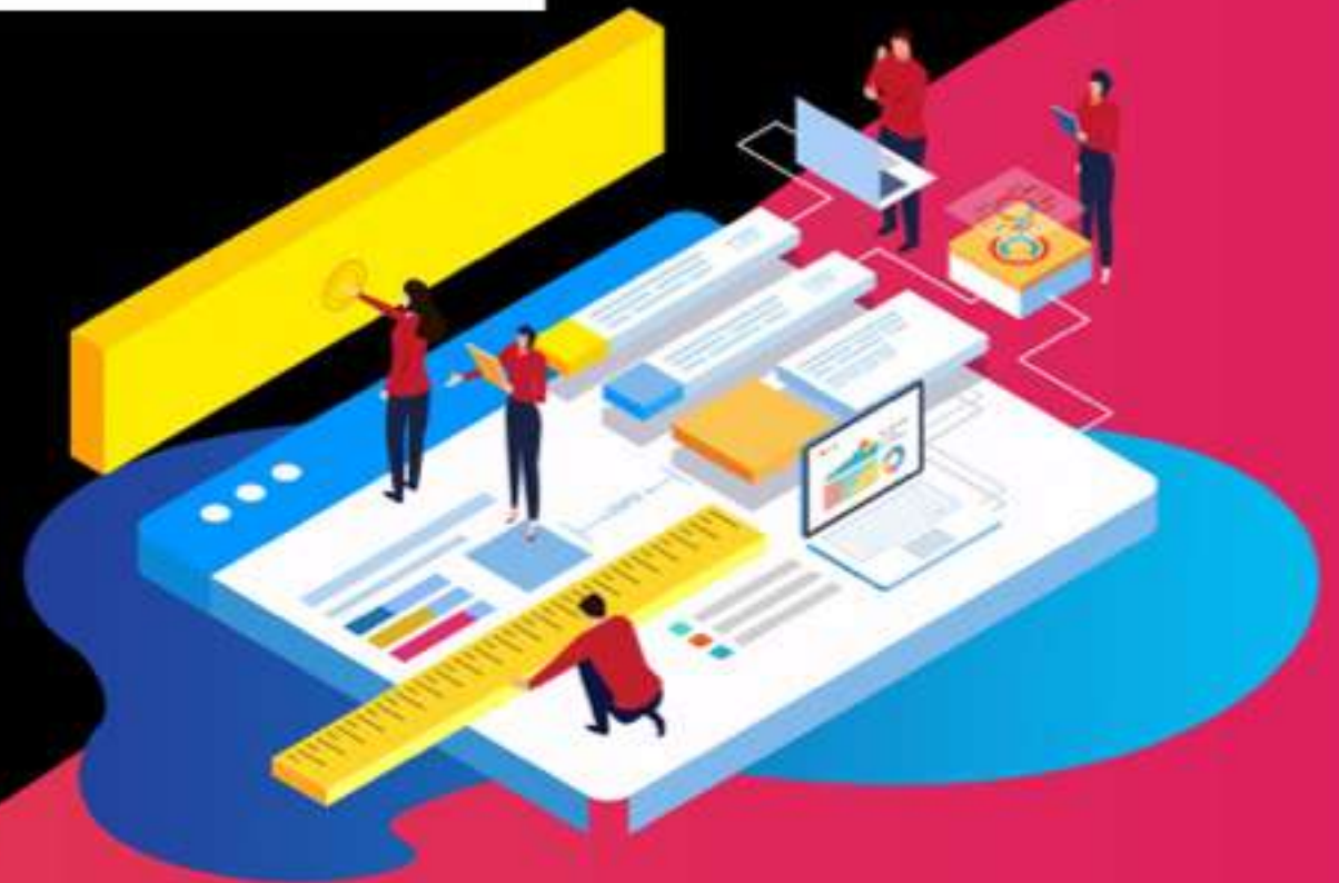
Data & Technology