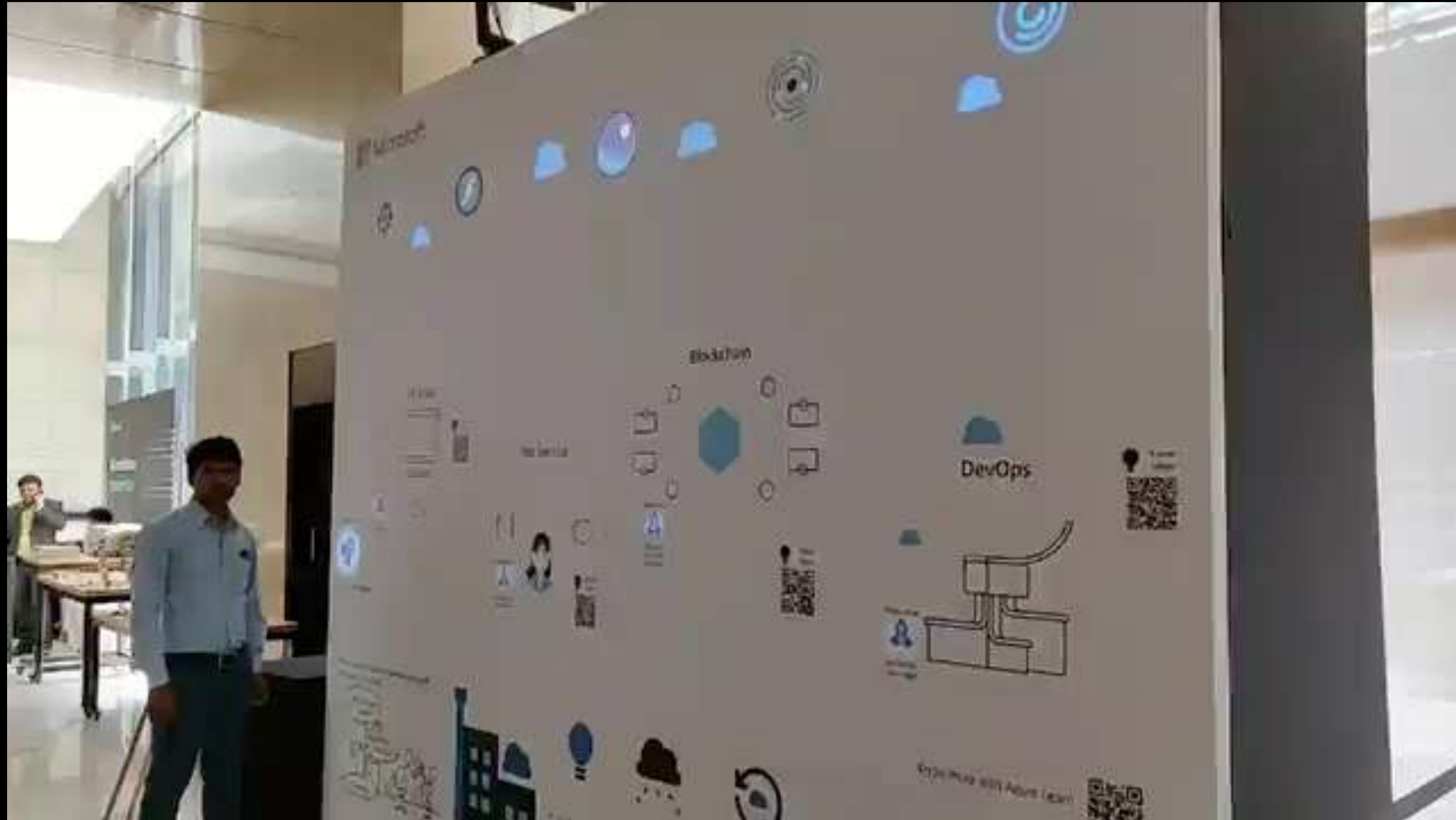
Interactive Projection Stall